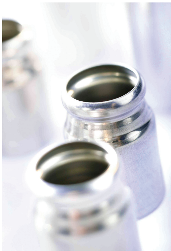
Figure 1: Aluminium MDI cans.

The process creates an ultra-thin layer that protects against degradation, deposi-