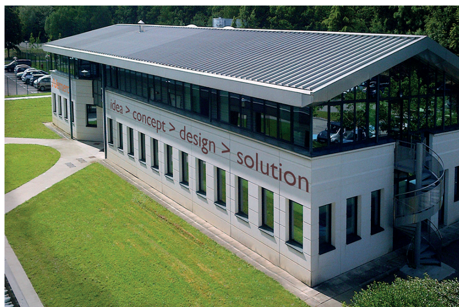
Figure 2: The Innovation Center at La Verpillière, near Lyon, France.

A We are not dogmatic. Whilst we understand the advantages of considering the manufacturing process from the outset, throughout the design and development stage, and we have built up this capability very successfully, our objective ultimately is to manufacture the device. We are not a design house, we are there to manufacture and so whatever the stage of development we are constantly asking the question, “How is it made?” We see our device design and development capabilities as essential for the rapid and efficient development of the manufacturing process. So if a customer comes to us with a given product, for us to industrialise it, then absolutely we are very happy to do it. Whatever stage it is at, perhaps a partially designed product, for example, we are fully able to interact. We can put around the table all the expertise required to get that product from whatever stage it has reached, to the market.