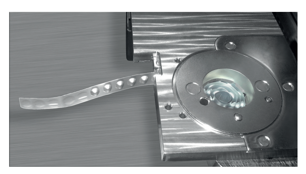
Figure 3: Blister coiling.