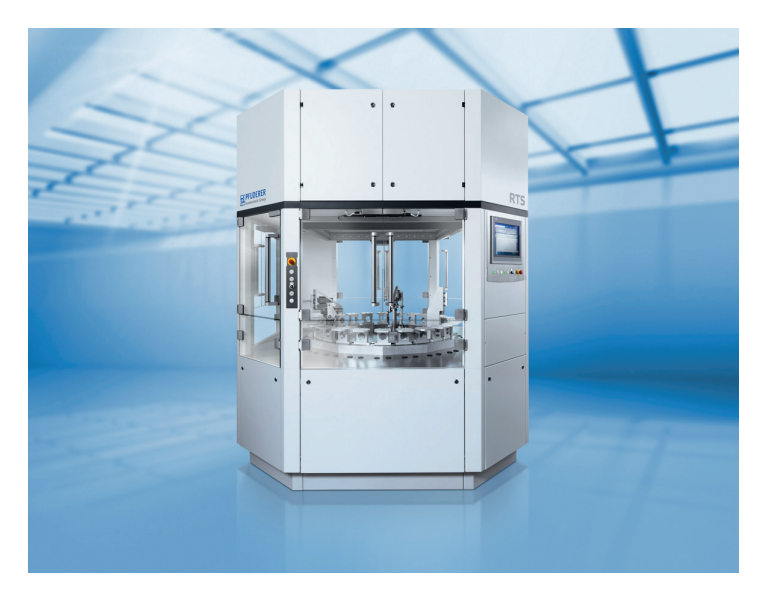
Figure 4: teamtechnik's cam driven machine, RTS.