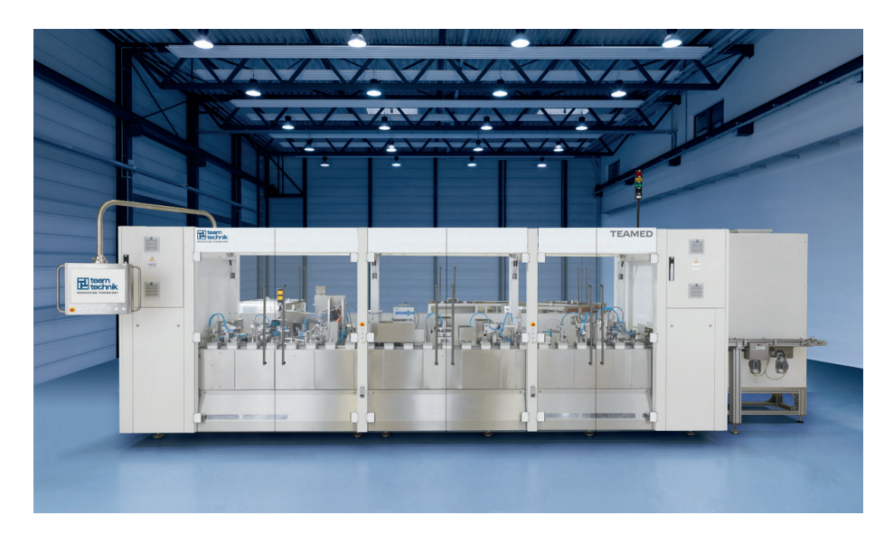
Figure 2: Assembly system at TEAMED platform.

"Able to accommodate up to five process operators working at the machine, it is often the case that a customer will engage with teamtechnik and utilise TEAMED PoP, while a device is still under development"