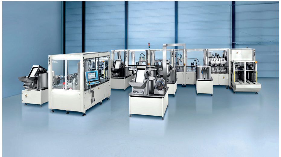
Figure 2: Assembly system at TEAMED platform.

Drawing upon teamtechnik’s comprehensive library of processes and its engi-