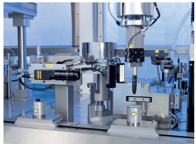
Figure 5: Testing and inserting the injector’s dial.