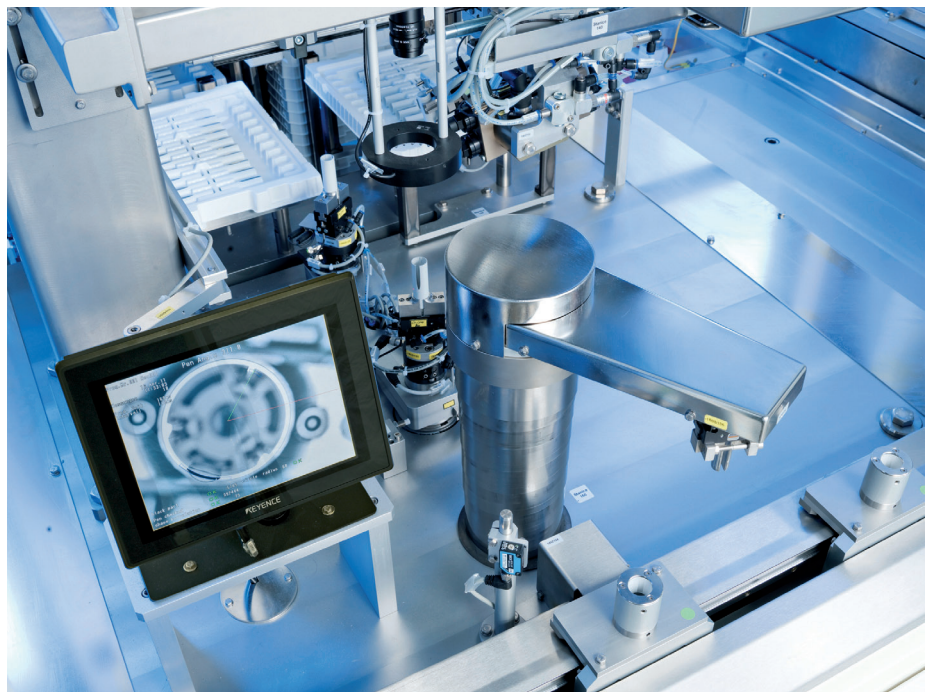
Figure 3: Testing and positioning the shell of an injector device.