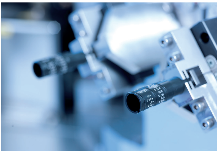
Figure 4: Laser engraving the injector’s dial.