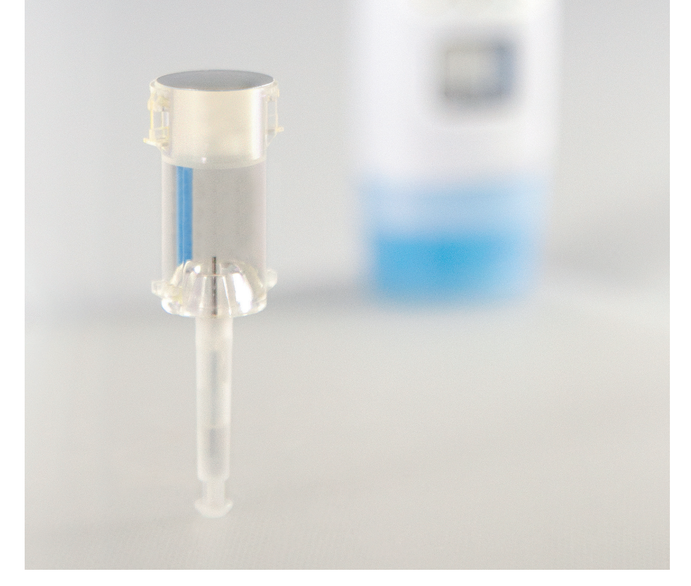
Figure 1: Oval's polymeric PDC technology.

For optimal device design and performance, the user interface should not be influenced by the forces required to deliver the drug and, similarly, the drug delivery mechanism should not be