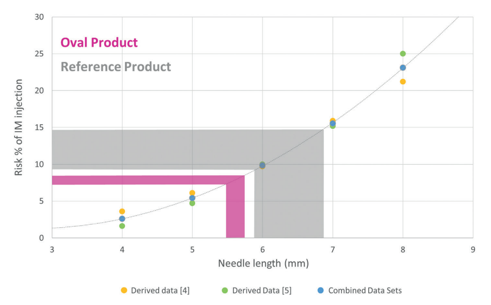
Figure 5: Injection depth versus risk of intramuscular injection at the anterolateral thigh.

full range of features (e.g. automatic needle insertion, end of delivery feedback and passive needle safety), within a simplified and compact form. The subcutaneous auto-injector platform actively decouples the drug delivery requirements from those of the user interface. The use of separate springs for needle insertion and for drug