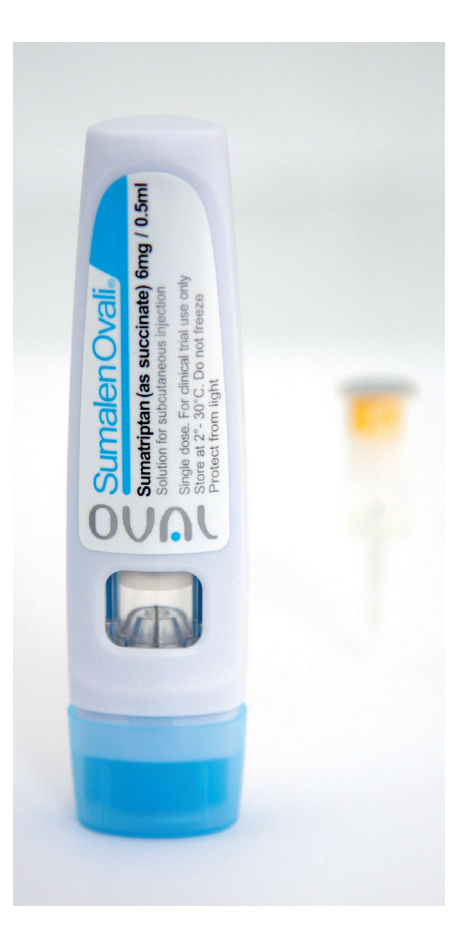
Figure 4: Sumalen Ovali, 6 mg/0.5 mL Sumatriptan single use auto-injector for the treatment of migraines and cluster headaches.

The cyclic olefin PDC provides the option to configure component geometry freely, whilst "designing in" strength to manage high viscosities (>100 cP). This permits the delivery of complex drug formulations alongside the inclusion of a