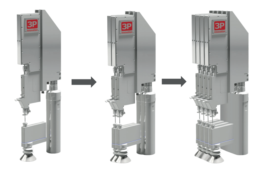
Figure 1: Fill2Weight is scalable and flexible, measuring, controlling and recording the weight of every dose, rather than dispensing a fixed volume.

Fill2Weight improves on the accuracy of volumetric systems by measuring, controlling and recording the weight of