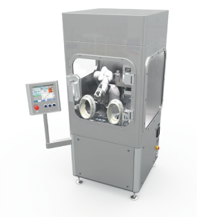
Device Filler with Transfer Isolator