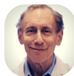
Keynote Robert Langer, PhD MIT