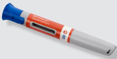
BD Intevia™ 1 mL disposable auto injector

FOR BETTER TREATMENT OF CHRONIC DISEASES. Across the healthcare continuum, BD is an industry leader in parenteral delivery devices that help health systems treat chronic diseases. We not only continually advance clinically proven, prefilled drug delivery systems, we do so with a vision to help healthcare providers gain better understanding of how patients self-inject their chronic disease therapies outside the healthcare setting. This is why we partner with leading pharmaceutical and biotech companies worldwide to develop digitally connected self-injection devices—including wearable injectors and autoinjectors—to capture valuable data that can be shared with caregivers. Discover how BD brings new ideas and solutions to customers, and new ways to help patients be healthy and safe. Discover the new BD.