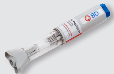
BD Physioject™ 1 mL disposable auto injector