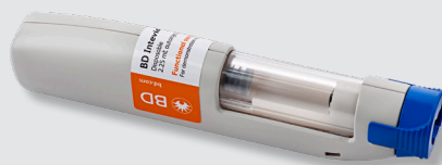
NEW! BD Intevia™ 2.25 mL disposable auto injector*