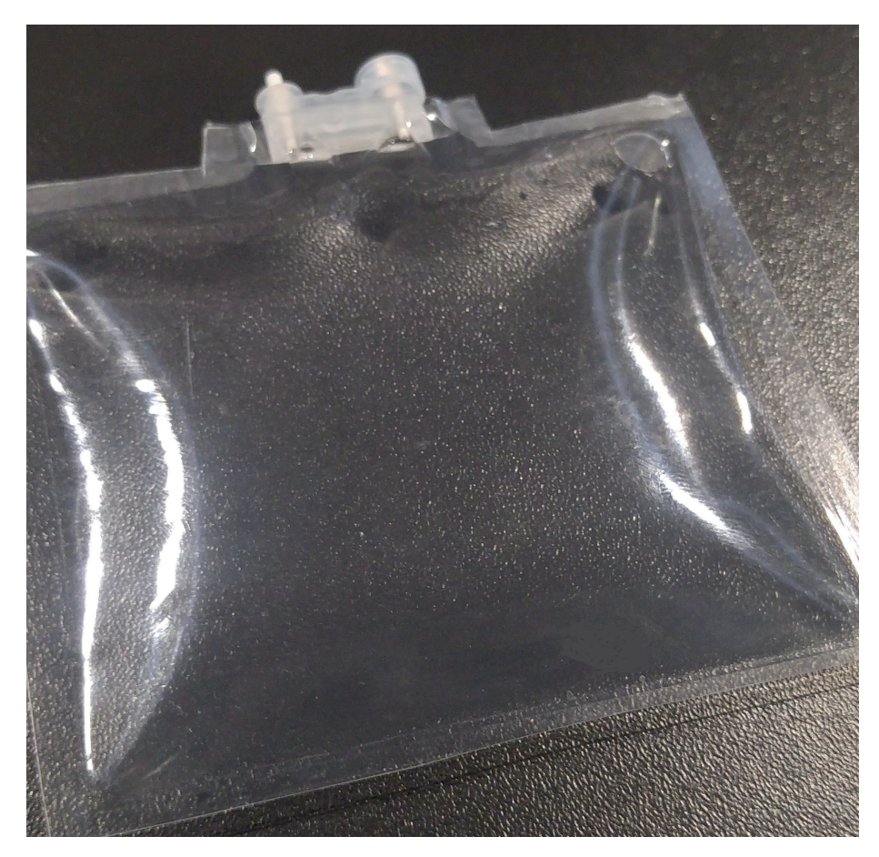
Figure 5: MiniBagSystem is a primary packaging solution with similar drug contact properties to glass.