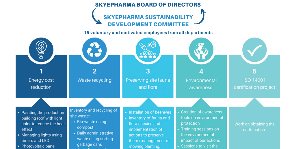
Figure 1: Skyepharma's sustainability development committee.