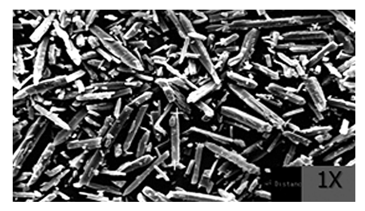
Figure 2: Particle size before the use of Microfluidizer technology: 100 µm.