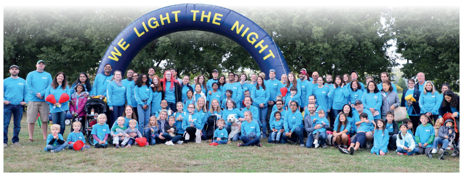
Figure 2: West team members volunteering to support the Leukemia & Lymphoma Society.

West was pleased to celebrate several safety milestones in 2019, including one site which reached one million hours without any injuries, two sites that celebrated five years accident free and four sites with zero safety incidents.