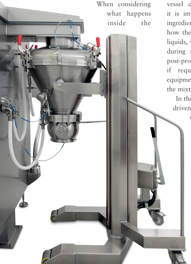
Figure 5: Lift system for conical mixers.

For the charging and discharging of toxic materials, for instance, Hosokawa Micron can use or develop customised container docking systems, such as lift systems or split butterfly valves (Figure 5).