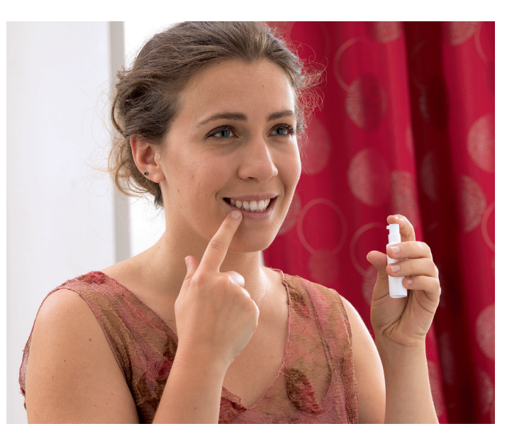
Figure 3: A patient using Sof'Airless XS.

As a world-leading drug device combination solutions specialist, Nemera's purpose of putting patients first enables it to design