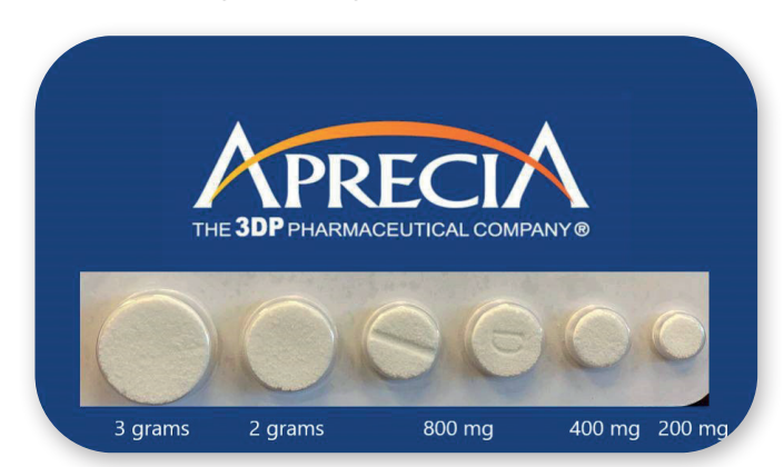
Figure 4: Tablets created using Aprecia's ZipDose technology showing size progression.

A partnership between Nanoform and Aprecia, a three-dimensional printing (3DP) pharmaceutical company, is set to explore how their respective technologies can be combined to create nanoparticle-enabled 3DP dosage forms (Figure 4).