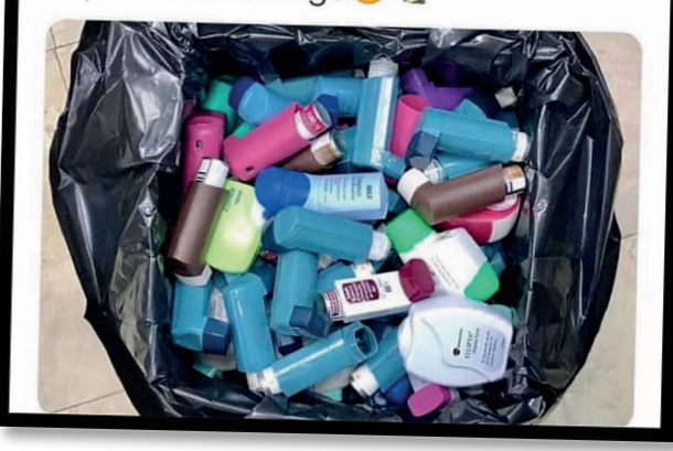
Figure 1: A 2019 Facebook post shared 20,000 times.

Another batch of used inhalers sent for recycling. There is absolutely no need for these to go to landfill. Inhalers are made of high quality plastics and aluminium. Please keep returning these to the pharmacy, we really appreciate it. Please share this important message