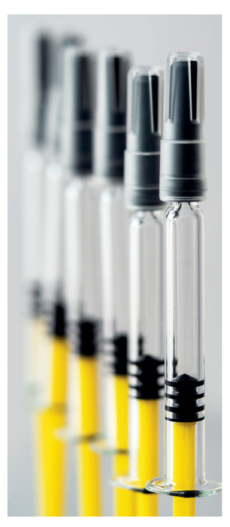
Figure 1: PFSs remain one of the fastest-growing classes of drug delivery device.

In addition, the decision is increasingly being driven by a desire to create more convenient drug products, easing or tailoring administration to the therapeutic need. When an injectable's intended use is during emergency surgery, in doctors' surgeries or in a variety of at-home care scenarios, simple and/or more rapid administration is often required. Ease of use can positively impact patient compliance, which is one of the longest standing problems in healthcare. PFSs (Figure 1) remain one of the fastestgrowing classes of drug delivery device, due to advances in technology and the increased development of parenteral drugs.<sup>1</sup>