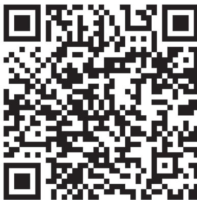
Figure 2: Scan this QR code for sample product history and patient feedback.

With Efixii, a simple QR code scan reveals the entire story of a product. Patients get trustworthy, tested and certified medical cannabis (Figure 2). They benefit from ratings and observations in the SeedtoSeed™ feedback loop and actively participate in the system. Tracking every gram grown and consumed for thousands of journeys supplies essential efficacy and dosing data, which, when fed back to cultivators, can help them to understand which products