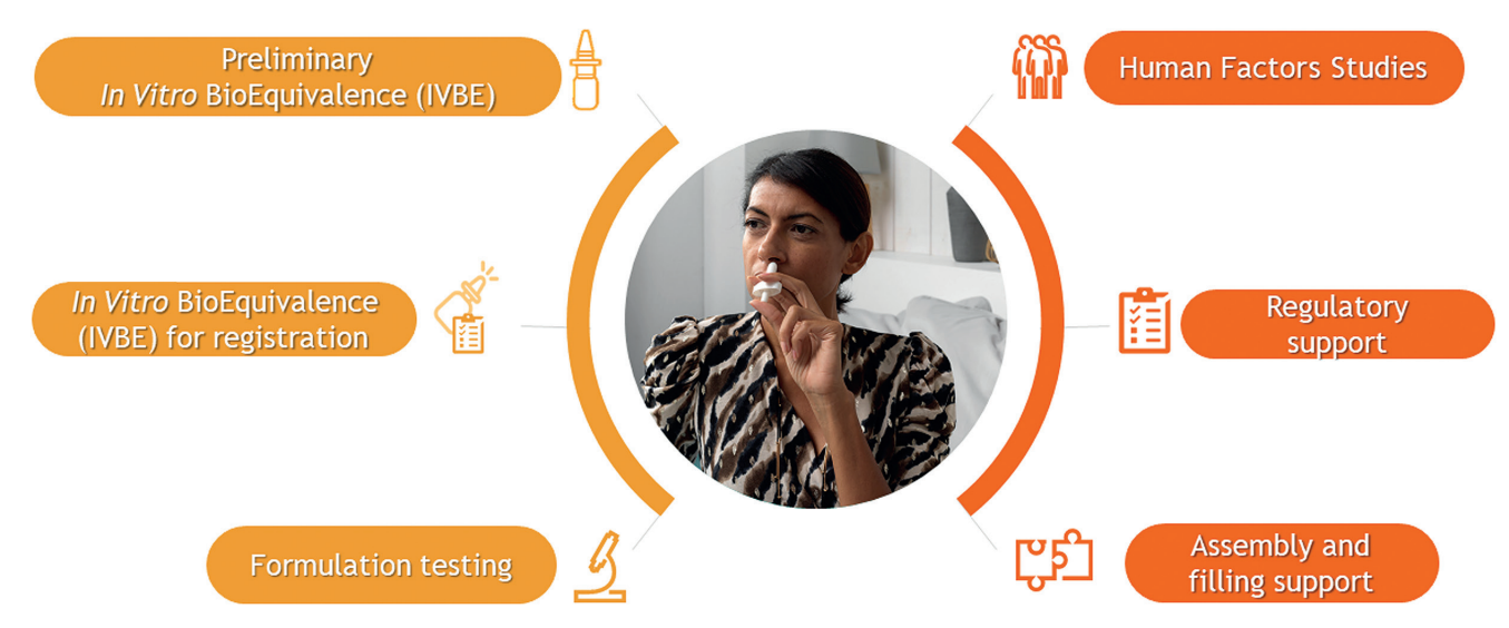
Figure 2: Answering combination product needs with Nemera's holistic services.

"An increasing number of prescribed systemic-acting drugs for acute conditions originally administered in injectable forms have been made available as unit-dose nasal sprays."