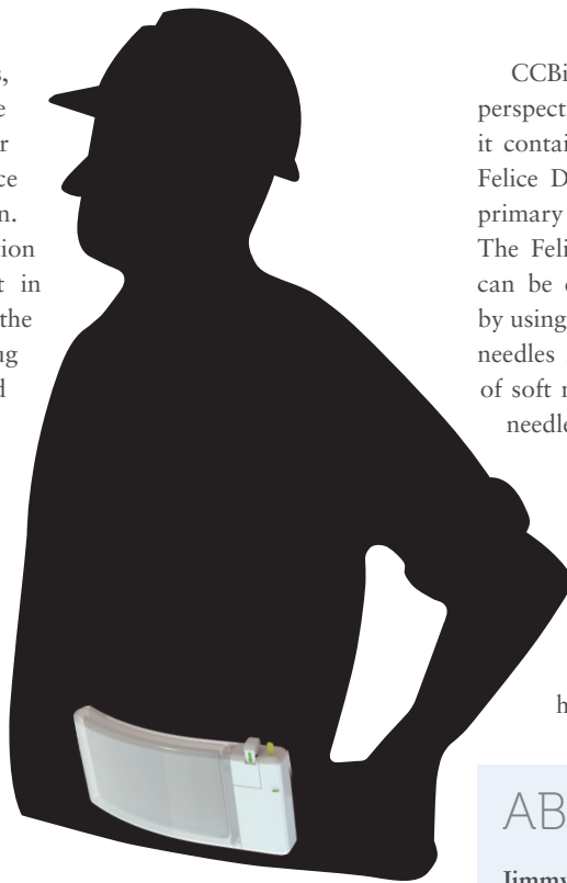
Figure 2: CCBio's Felice Dose.

Felice Dose's delivery motor system is capable of handling various drug volumes, concentrations and viscosities, as well as different injection speeds and delivery times. The delivery motor system does not require continuous power, which has enabled CCBio to reduce the size of the battery and therefore the overall weight of the device. CCBio is currently testing the Felice Dose system for a 250 mL injection lasting up to 12 hours.