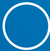
Special Thin wall

Needle inner diameter increases reducing wall thickness