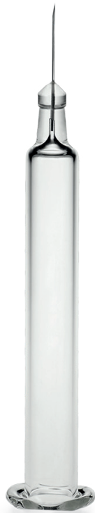
Figure 1: The enlarged internal channel diameter of sTW needles enables a smooth delivery of highly viscous biologic solutions without the need for higher gauge needles.

Many factors contribute to the overall sensation of pain associated with an injection, from the location on the body to the injecting action and the nature of the formulation, including make-up and volume. While it is not possible to manipulate and resolve all these variables, certain key elements can be addressed to help limit pain, including the thickness of the needle wall.