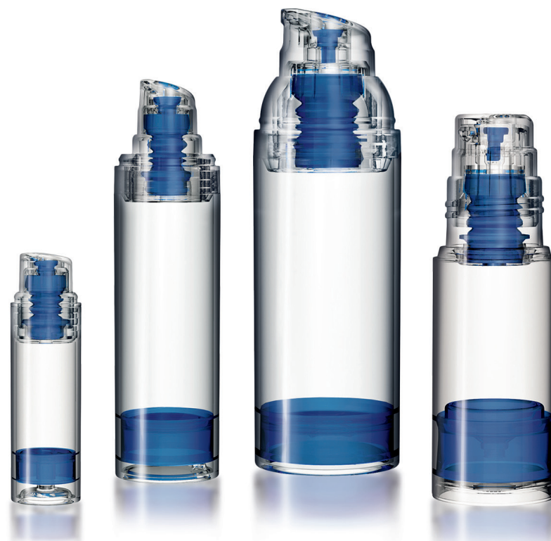
Figure 3: Dermal drug delivery is an important area of focus for Aptar Pharma with its Airless + packaging systems.

A While there are a number of airless packaging providers out there, Aptar Pharma's offering is different in that we can offer a full, integrated package of services. Our customers know that we have proven successes supporting customer approvals using our Airless + systems with a range of regulators. We have also started to create dossiers and drug master files with relevant authorities to accelerate the process further. Aptar Pharma's airless systems have been used in more than 50 commercially marketed drug products.