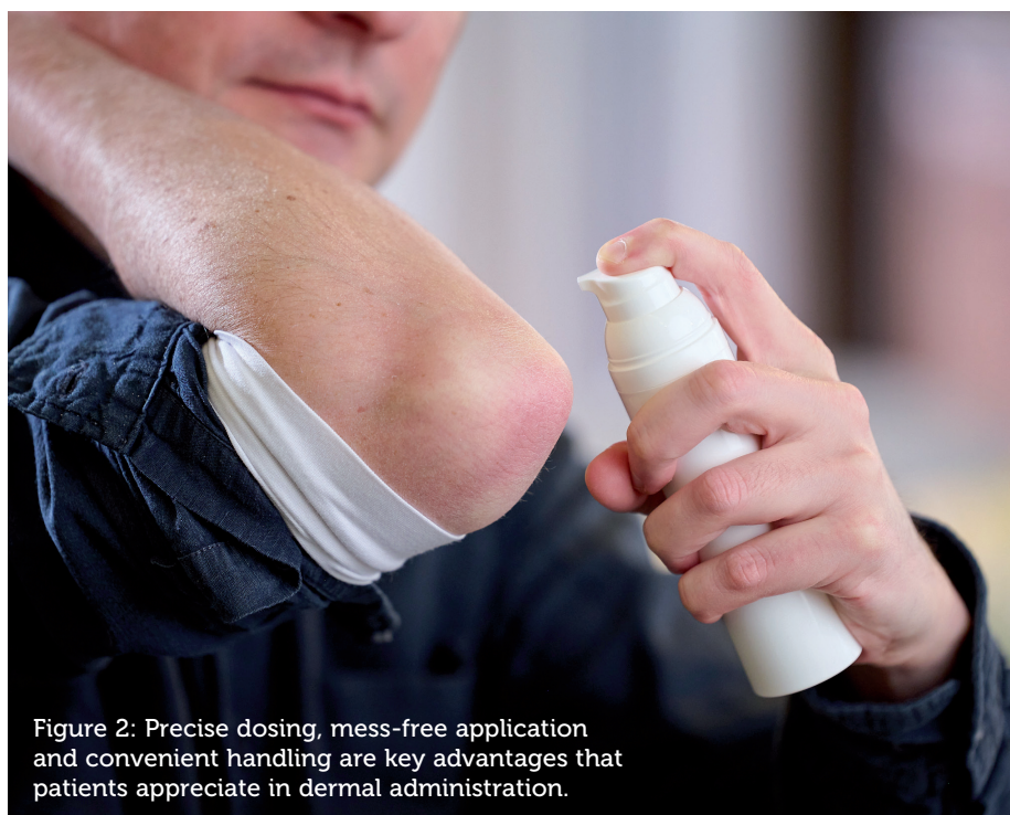
Figure 2: Precise dosing, mess-free application and convenient handling are key advantages that patients appreciate in dermal administration.

A Yes, patients and users have also started to discover the benefits of airless packaging systems, citing features such as ease of use and clean dose delivery as attractive benefits (Figure 2). Airless packaging can also extend the lifespan of a product, and the efficiency of the dispensing system means there is minimal waste of valuable product formulation. Another functional benefit of airless packaging systems is that their leak-resistant properties improve their portability, allowing them to be safely carried in a handbag or backpack. Patients can self-administer a precise dose of semi-solid