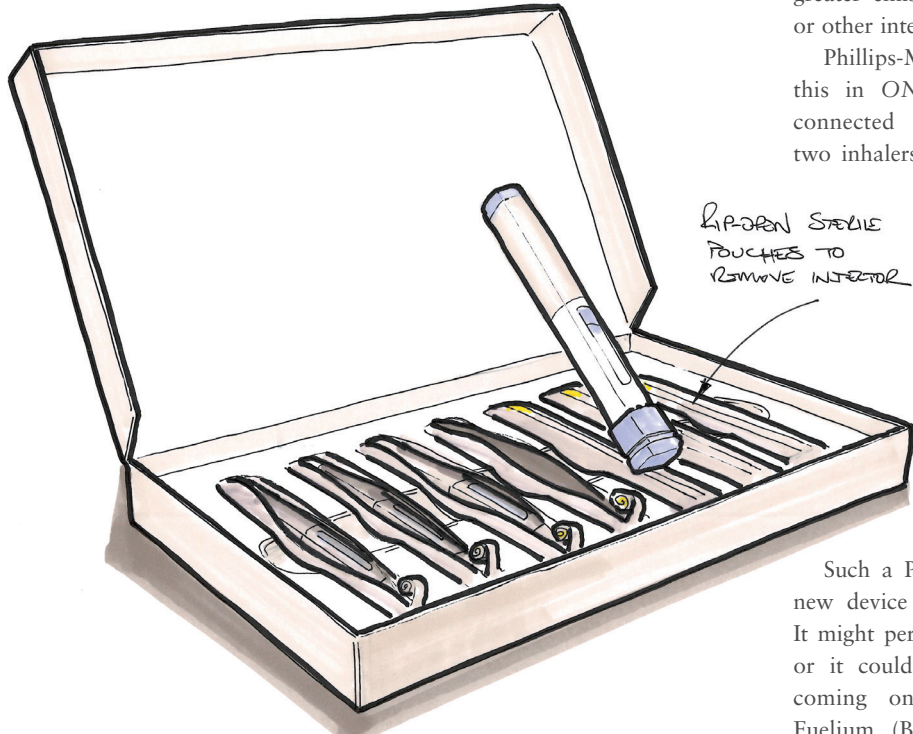
Figure 3: Sketch of sterile autoinjector packaging suggestion.