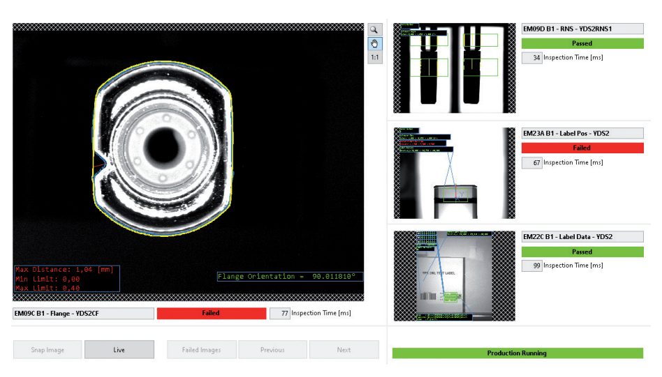
Figure 1: Inspection module with a variety of device verification checks.

Stevanato Group's Standard Autoinjector Assembly Machine platform offers the option of in-line laser engraving. This capability allows manufacturers to add essential product identification information, such as branding or batch numbers, directly onto the autoinjector. The in-line laser engraving feature ensures accurate and permanent marking, enabling serialisation on the assembly line and enhancing product traceability and compliance. This is achieved by engraving a 2D barcode onto the device, which enables full product provenance throughout the lifetime of the product. This can be integrated with the company's data-collection platform for a datadriven, real-time monitoring approach to component traceability. Additionally, an independent laser engraving module can be installed in extension of the labelling module, which provides the ability to engrave customer-specific data onto various label heights, with the machine able to inspect and reject any labels that do not