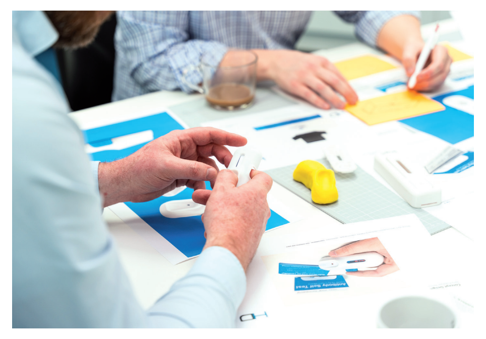
Figure 2: Following DFA principles can lead to reduced assembly time and costs for a device, as well as improved reliability and quality.

costs, but also prevent confusion during assembly and result in fewer assembly issues. However, be mindful that overly complex components might unnecessarily increase manufacturing costs.