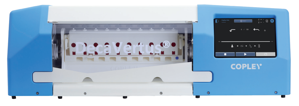
Figure 2: DecaVertus III is a multi-station automated shake, fire and flow control platform for MDIs with dedicated air flow and waste channels for up to 10 devices.

"The Vertus range comprehensively and efficiently meets requirements for automated shake, fire and flow control for MDIs and nasal sprays."