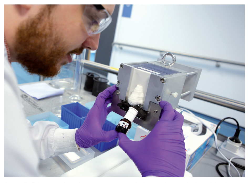
Figure 3: Side view of the Aeronose nasal cast being used to study deposition in the nasal cavity.

A The primary value of nasal casts lies in their utility for rapid screening, for education and for device and formulation selection. We know that nasal casts can provide a good prediction of in