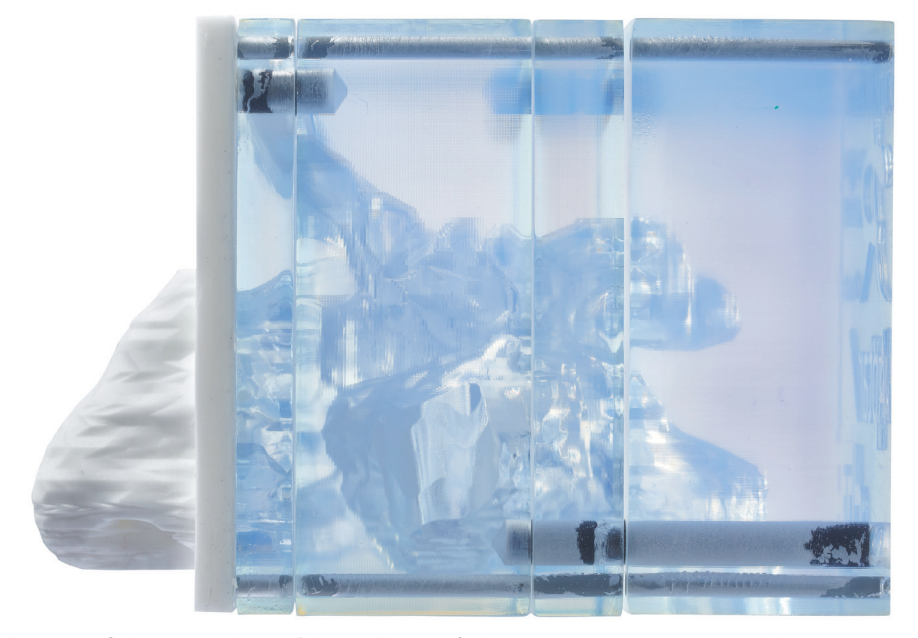
Figure 1: Schematic view of Aptar Pharma's Aeronose nasal cast modelling.

Validation against in vivo data is essential to ensure the relevance of your model and give it weight. Using models that are already validated, via academic collaboration or service providers, can therefore prove both cost and time effective. For example, Aptar Pharma offers access to its Aeronose<sup>TM</sup> nasal cast, which was developed by Aptar Pharma in collaboration with the University of Tours (France) and has already been validated with both liquid sprays and nasal powders (Figure 2).