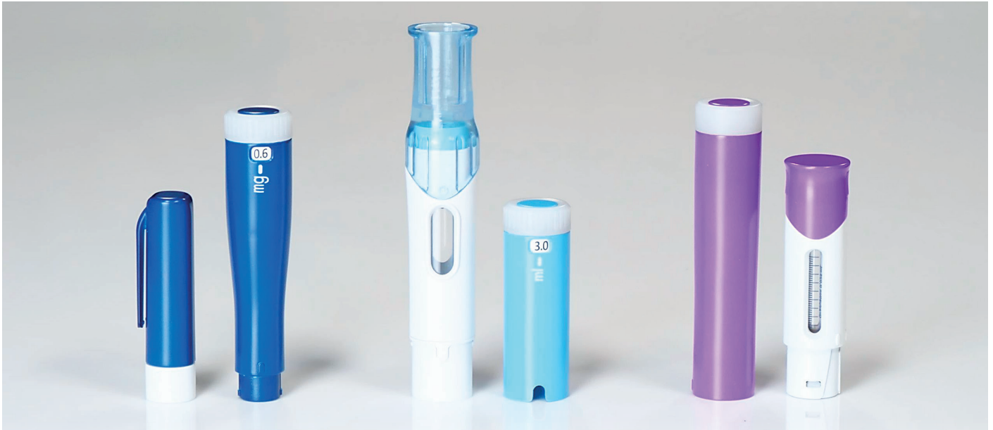
Figure 5: The reusable power units and the disposable units of the Alcee platform.

from the vial into the body of the injector. Upon completing the drug transfer process, the user removes the cap along with the vial, and then performs injection just like a typical autoinjector. Besides the automated drug transfer, the injection process is also powered by the automated drive system. By avoiding manual operation of drug transfer and injection, the risks of user handling errors, dose inaccuracy caused by manual transfer, and sharps injury are greatly reduced.