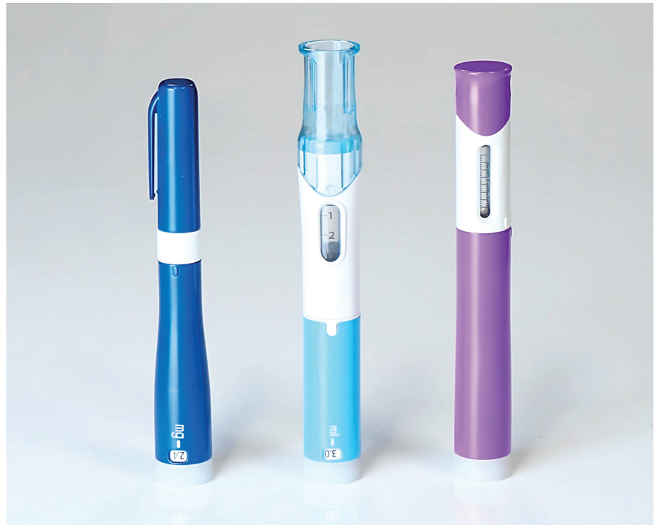
Figure 1: An overview of the Alcee injection platform – (left to right) multi-variable-dose pen injector, single-dose vial autoinjector and single-dose prefilled syringe (PFS) autoinjector.

Alcee injectors comprise a reusable power unit and a disposable unit. The power unit provides the electromechanical drive and is rechargeable. The reusability of the Alcee power unit can reduce the cost per injection compared