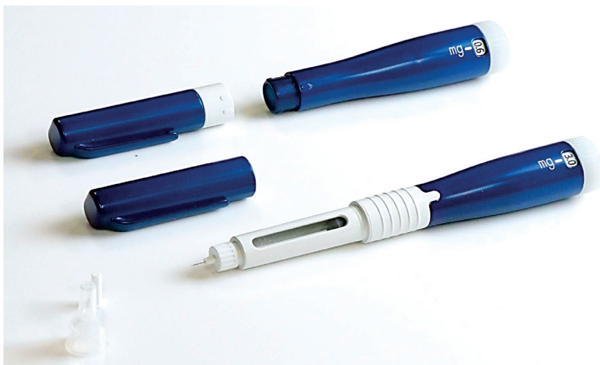
Figure 4: The designs of Alcee-P.

Alcee-V also provides an innovative solution that makes the preparation of a drug from a vial and the self-administration process simple, easy and safe. Since the vial filled with the drug and the Alcee-V device are not housed together, the user is able to access and clean the vial stopper prior to injection. After disinfecting the stopper, the user loads the vial into the cap of the Alcee-V. Aided by the automated function, the drug is automatically drawn