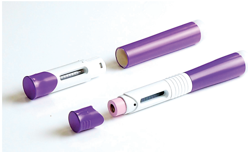
Figure 3: The designs of Alcee-PFS.

Although vials are the most commonly used containers for packaging pharmaceuticals, they rarely appear in self-injection devices, in part due to the complexity of drug handling from a vial and the involvement