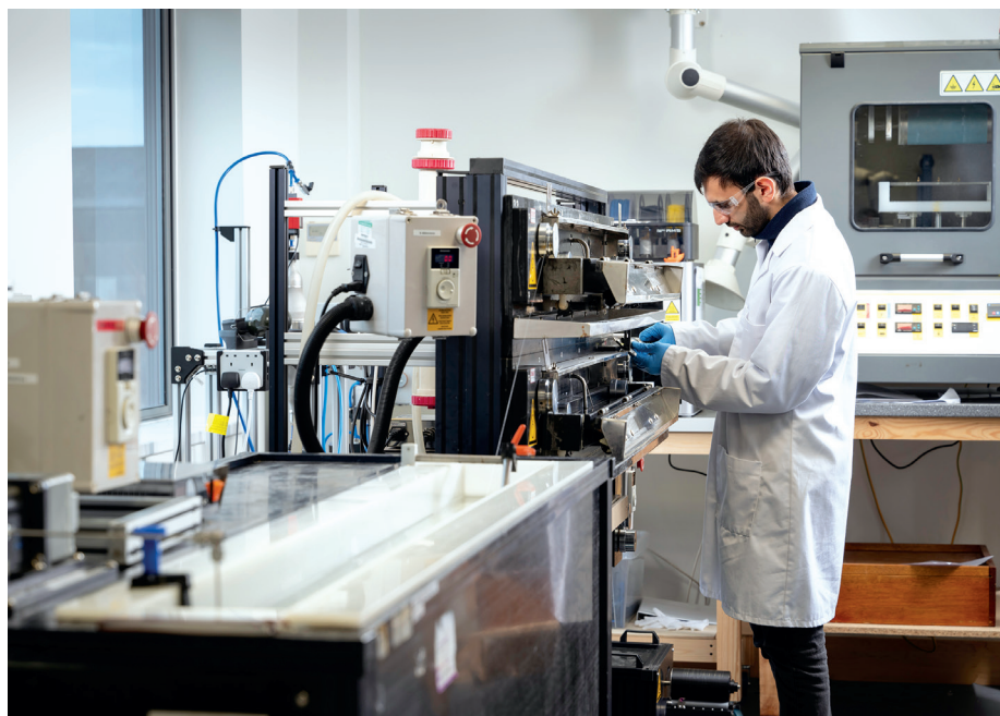
Figure 2: By combining strategies and approaches, it is possible to create PFAS-free alternative materials with comparable performance.

The timescales for development of new PFAS-free drug delivery devices and packaging are generally significantly longer than the likely derogation periods. The EPPA report estimates that for solid dose blisters that contain a PFAS layer – assuming that a safe and appropriate alternative can be found – the timeframe is